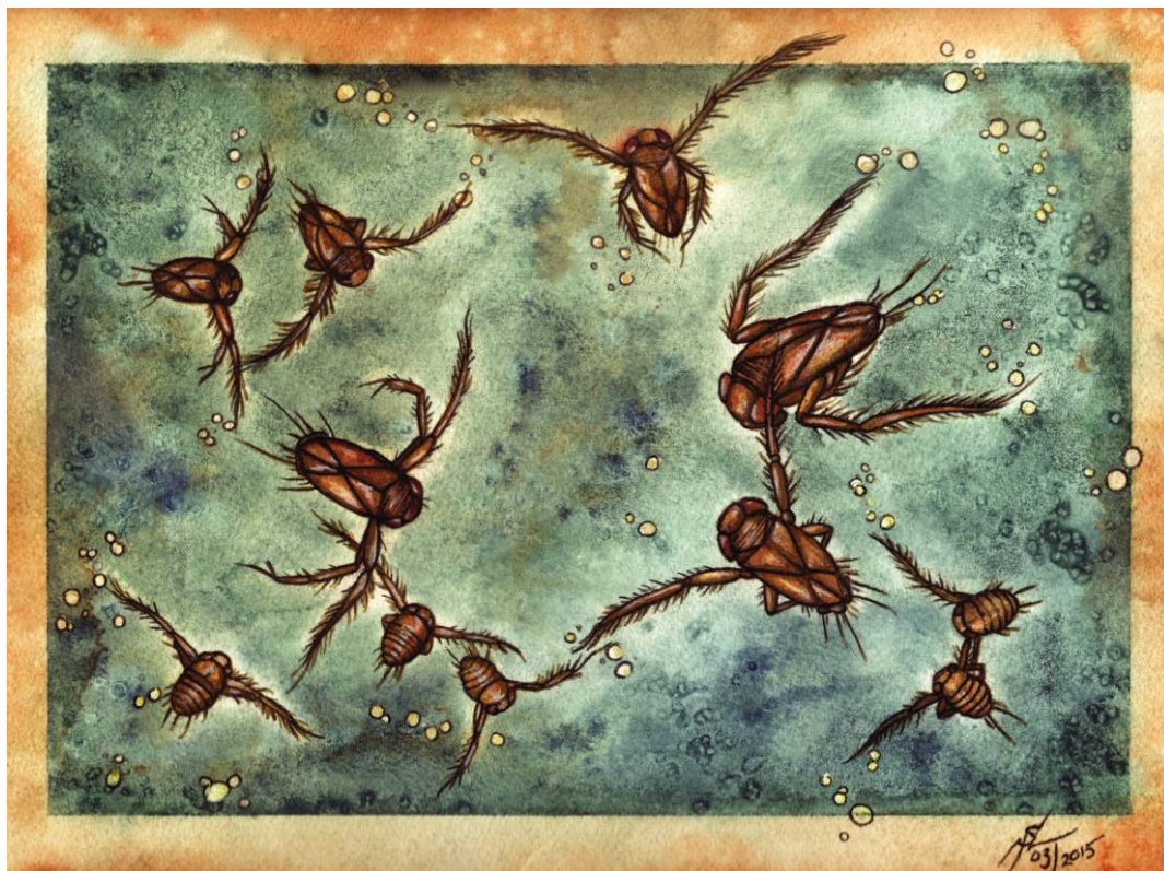
“Vast numbers of Corixidae were living in the water”—G. E. Hutchinson ( The American Naturalist, 1959, 93:145–159).